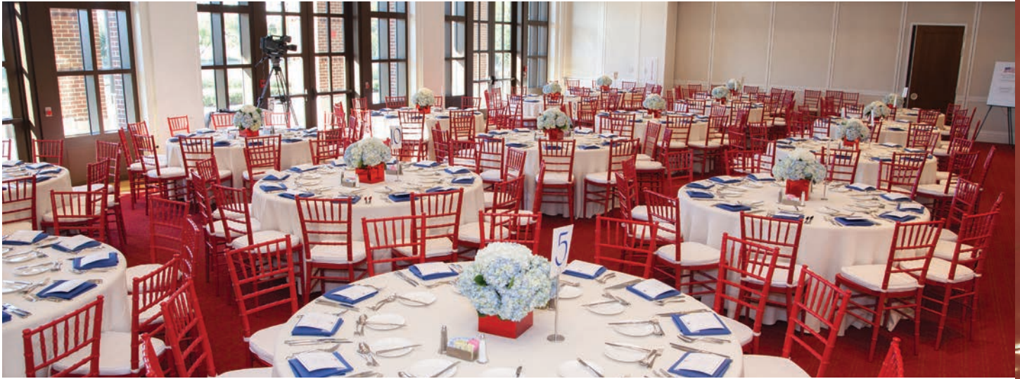
Hall of State