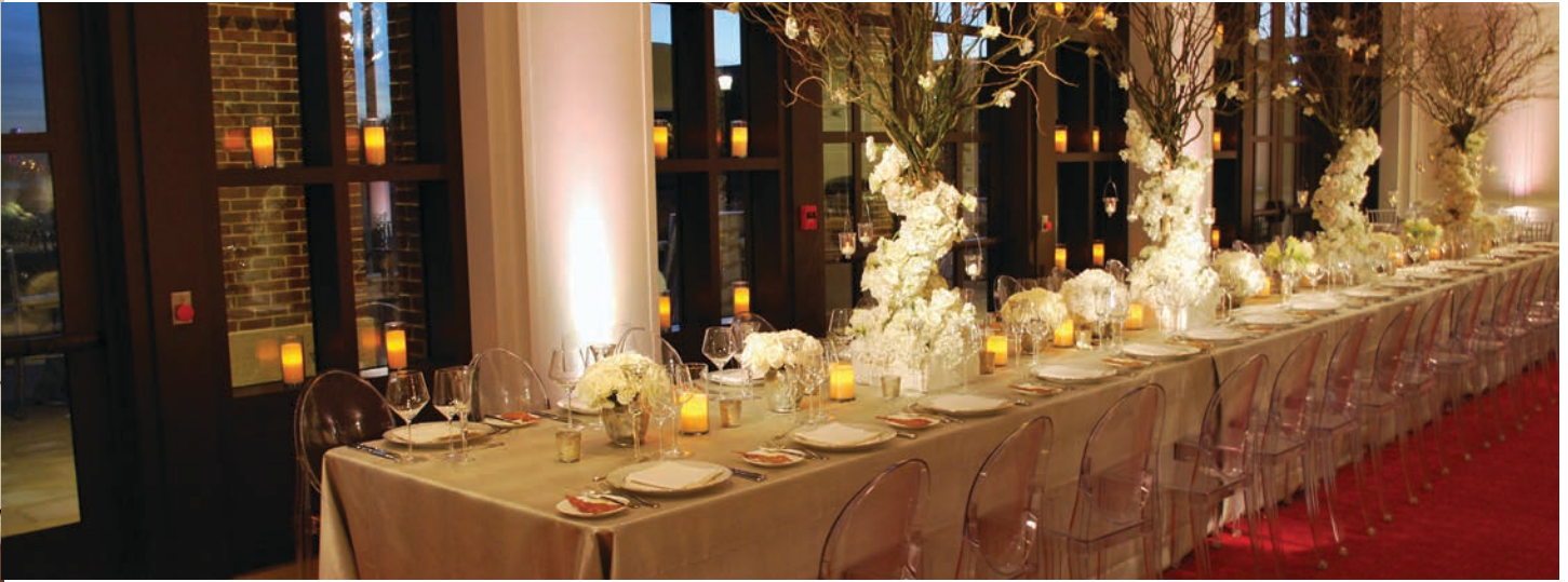
Hall of State

The George W. Bush Institute at the Bush Center features a state-of-the-art auditorium and the beautifully appointed Hall of State, with an outdoor terrace overlooking the impressive Native Texas Park - inspired from design elements found in the White House.